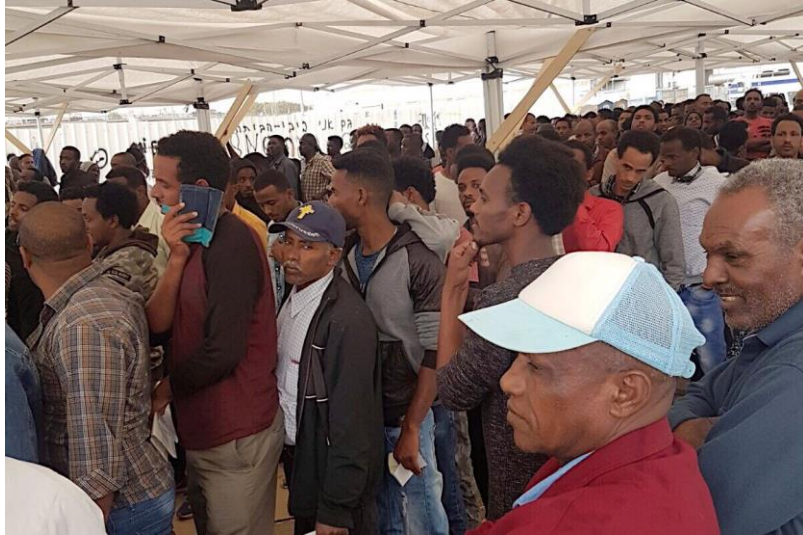
↑ Queue outside the PIBA offices in Bnei Brak