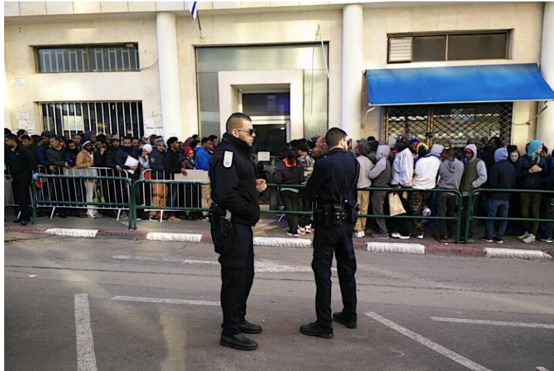
↑ Queue outside the PIBA offices in Tel Aviv, © Amnesty International/Chen Brill Egri

Amnesty International visited the RSD Unit office in Tel Aviv about 20 times in 2017 and early 2018; after January 2018, when the office was transferred to Bnei Brak, a city just east of Tel Aviv, the organization gathered information, photos and videos through its contacts there. The organization's observers saw queues of hundreds of people forming outside the Unit's Tel Aviv office, forcing people to spend the night in the street to be first in line. Even when reaching the top of the queue, asylum-seekers from Eritrea and Sudan were often refused entry, as the security guards arbitrarily refused entry to those with a valid resident visa, telling them to return once their visa expired. Amnesty International observed that, on average, only 10-12 asylum-seekers from Eritrea or Sudan were admitted into the office on any given day. On average, more than 200 asylum-seekers would be denied entry and left outside of the office.